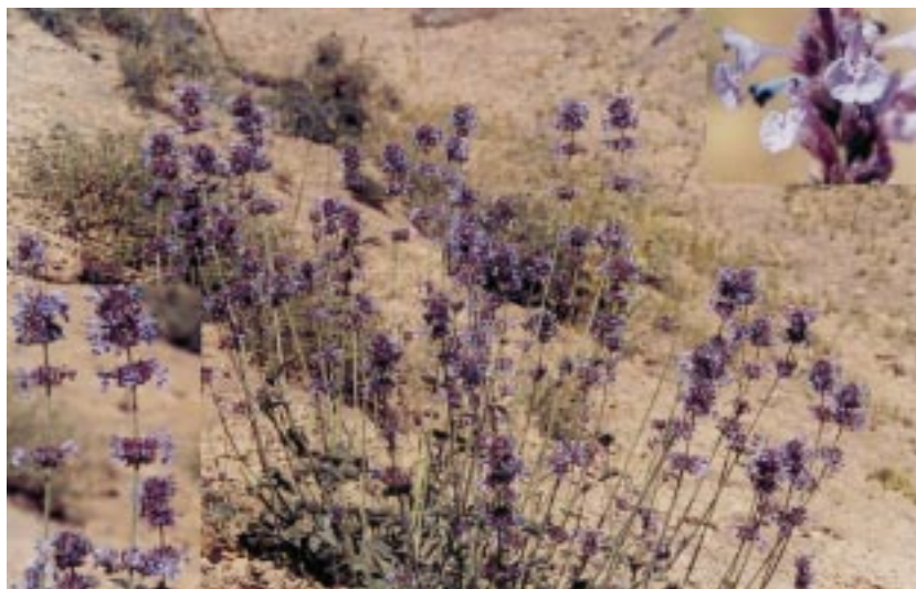
Figure 4. N. obtusirena Boiss. & Kotschy ex Hedge; Habitus, flowers and verticillasters.

N. obtusirena now is known from 3 different localities. The locus classicus of the species is Siirt-Müküs (Bahçesaray). No specimens were found at the type locality. This may be due to the unclear type locality given in the original description or to the species becoming