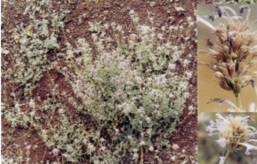
Figure 2. N. baytopii Hedge & Lamond; Habitus, flowers and verticillasters.