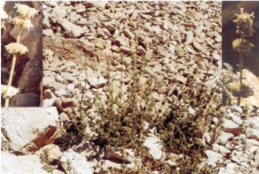
Figure 5. N. sorgerae Hedge & Lamond; Habitus, flowers and verticillasters.

During the field studies, it was observed that some individuals had been crushed by visitors. With its small growing area, the scarcity of individuals in the population and the destruction in its habitat, N. sorgerae will become extinct in the near future. For all these reasons the species should be placed into the "CR" (critically endangered) category.