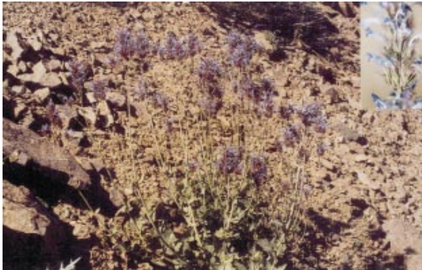
Figure 3. N. crinita Montbret & Aucher ex Bentham; Habitus, flowers and verticillasters.

Leaves ovate, 1-4 x 0.8-3, thickish in texture, crenate, cordate, finely pilose with very short hairs; lower leaves petiole c. 2 cm, upper leaves 0-2 mm. Verticillasters many-flowered, shortly pedunculate, distant below, approximating and sub-conferted above. Bracteoles filiform, subulate, finely strigulose, c. 7-12 mm. Calyx narrowly tubular, purplish, 9.5-11(-13) mm, straight, mouth suboblique, strigulose with very short eglandular hairs and sessile glands, teeth unequal, finely filiform, aristate, 4-7 mm. Corolla purplish, 11-14.5(-15) mm,